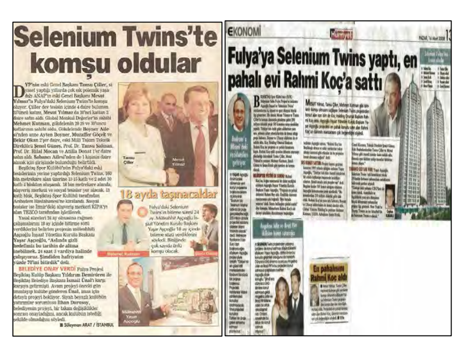
Figure 4: 'They became neighbors in Selenium Twins" Headline in ad emphasizing a community of elite neighbours like ex-prime ministers Tansu Çiller, Mesut Yılmaz, tycoon Rahmi Koç, and the presentation of ex-president Bill Clinton a flat free of charge as part of the firms' marketing strategy (Source: From the website of Aşçıoğlu, <u>www.ascioglu.com.tr</u>, 2009).

• Marketing of 'Gender': The meaning of home is generally perceived as gender-specific and as such, constructed differently for women and men in advertising media. While women are mostly portrayed as liberated from house chores and enjoying themselves, man are usually involved in masculine activities such as playing golf or the like (Figure 5).