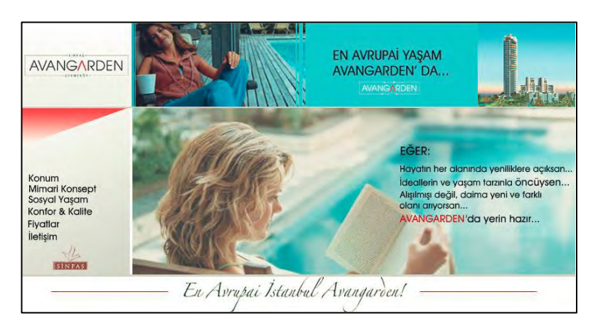
Figure 5: Sinpaş Avangarden ads depict a feminine view of life to Avangarden Project (Source: From the website of Sinpaş Avangarden Project, <u>www.sinpasgyo.com,2007</u>).

• Marketing of 'Gender': The meaning of home is generally perceived as gender-specific and as such, constructed differently for women and men in advertising media. While women are mostly portrayed as liberated from house chores and enjoying themselves, man are usually involved in masculine activities such as playing golf or the like (Figure 5).