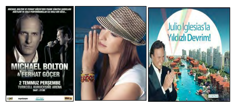
Figure 8: Sinpaş Bosphorus City was launched by Julio Iglesias's concert, and the campaign was kept alive with the concerts of Ferhat Göçer & Michael Bolton, and Gloria Estefan that followed Iglesias (Source: From the website of Sinpaş GYO, www.sinpasgyo.com, July 2009).

There is no end to the prolific creativity of marketing. Marketing firms keep on inventing new strategies to create spectacles during the launch of new developments. They invite celebrities for concerts (Figure 8) and give them free apartments, give free SUVs to homebuyers and aim to demonstrate that these celebrities do share the lifestyle that you buy with your home.