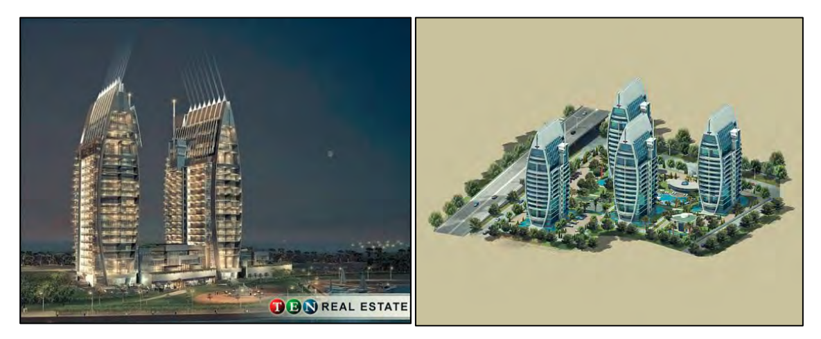
Figure 12: The picture on the left is-The Jewels from Dubai Marina, RMJM Group. The picture on the right is Royal Towers by Dumankaya depicting a life in Dragos, Istanbul (Source:From the website of Arkitera Forum, <u>www.arkitera.com</u>, 2009).

imagery that circulates in other markets might easily make a stop in your neighbourhood in the name of high-flying lifestyles, sometimes shamelessly copied and remarketed (Figure 12). What is of value for the marketer is the quick translation of the image into currency, as 'originality' is a simple, powerful but ephemeral catalyst in marketing. In this dazzling speed of global image circulation, originality expires the fastest, while the upper middle classes consume one 'distinct' lifestyle after another.