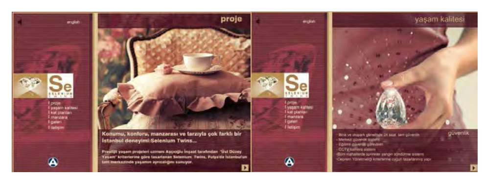
Figure 7: Images depicting the lifestyle marketed via Selenium Twins by Aşçıoğlu.

As production lost its privileged status in culture, and consumption became the means through which individuals define their self-images, marketing rose to become the primary agent that defined identity formation. Advertisers take a hegemonic role in the representational process of 'home' (Figure 7). Baudrillard suggests that we purchase objects because we are swayed by the sense that advertisers are taking an interest in us, that they exude some warmth and that this personalizes the objects for sale. Gottdiener confirms Baudrillard, and adds that 'advertising has heightened the extent to which commodities of all types are fetishised and made to symbolise attributes that are craved.' (Gottdiener,2000). Products are fetishised because they are bought in the belief that they can enhance the purchasers' abilities for success, notoriety, uniqueness, identity or a sense of self, privileged social status, and personal power. (Corrigan,1997).