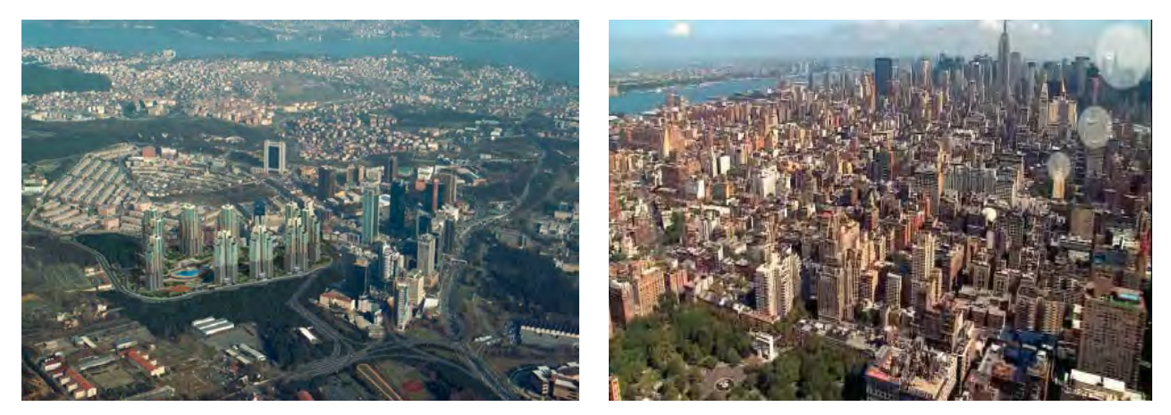
Figure 9: Mashattan, Istanbul vs Manhattan, New York (Source: <u>www.tasyapi.com</u>, 2007; <u>www.google.com</u>, 2007).

In the planning process of gated communities in Istanbul, generally samples of gated communities from the United States receive attention for both their architectural contents and administrative styles. These high-end housing settlements are given semi-Turkish, semi- English, Latin, or Italian names. 8 of the 8 firms preferred to base their designs on American precedents and 6 of them preferred names like, 'Mashattan, Pelican Hill, Uphill Court, Trend, Plus, Minimal, Trump Towers, Novus Residence, Bosphorus City, Lagun, Marenegro, Avangarden, Selenium Twins, etc. (Figure 9).