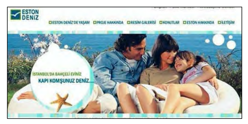
Figure 10: Images of 'happy, ideal family with single child' from Eston.

Almost in all of these campaigns production relations are either abstracted or totally erased where the disconnection of the resident from his/her 'real' daily surroundings come to fore. For instance, it is almost always young couples with one or two children that are depicted, while aging and its related problems are absent (Figure 10).