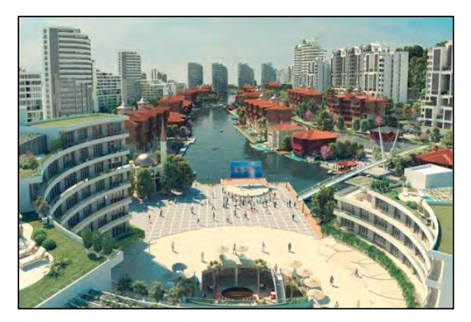
Figure 3: Sinpaş Bosphorus City rendering that aims to recreate the Bosphorus.

• 'The Good Old Days: The Marketing of 'Nostalgia': Another dominant marketing strategy is the use of so-called 'traditional' or 'authentic' elements of architectural culture. Marketing preys on the idea that nostalgia for a given period or periods is quite attractive for the new buyers (Figure 3).