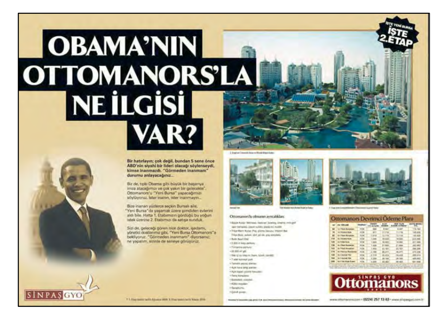
Figure 6: 'What's Obama got to do with Ottomanors?': An ad from Sinpaş GYO that takes its provocative edge from the unprecedented election of a black American president, claiming that the provided housing development is as unprecedented as this election. (Source: www.sinpasgyo.com, May 2009).

It is important to acknowledge that print media is only one of a number of media through which home-related popular taste is conveyed. Since the late 1990s, for example, home and gardening television programmes have proliferated and have been an important source of ideas about house and garden design, services and products which remain to be researched. In Istanbul, at least, magazines and other print media have played an important role for a very long time, and other media (television and the internet in the present) are supplements to printed media. It is apparent that the lifestyles portrayed in these media have arisen within a global framework and the products and ideas highlighted in Istanbul could be discussed with reference to many different places with comparative ease.