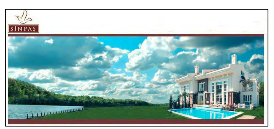
Figure 2: A picturesque photomontage of Sinpaş Marenegro Houses with a commanding the view of the – forest and the lake (Source: From the website of Sinpaş Marenegro, <u>www.sinpasgyo.com</u>, April,2008).

• 'The Good Old Days: The Marketing of 'Nostalgia': Another dominant marketing strategy is the use of so-called 'traditional' or 'authentic' elements of architectural culture. Marketing preys on the idea that nostalgia for a given period or periods is quite attractive for the new buyers (Figure 3).