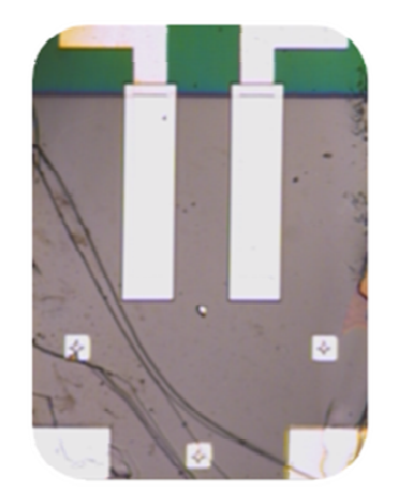
Fig. 3 Optical photograph of double mesas.

After the mesa fabrication, the exact dimensions of the mesas were obtained using surface profilometer and atomic force microscope. We have taken SEM images and optical photos of the samples. Figure 3 is optical photo of a one of the double mesas. The number of Josephson junctions were determined which gives emission voltage. The electrical characterization of the mesas was obtained room temperature through low temperatures. In order to characterize the Bi2212 mesas, by three probe contact c -axis resistance versus temperature (R-T), and current–voltage behavior (I-V) were measured in a He flow cryostat. During I-V characterization, we used a Si composite bolometer to detect the THz emission. The c-axis R-T measurements of the mesas exhibit near underdoped behavior of Bi2212 single crystal. Some of the hysteretic quasiparticle branches are seen in the I–V characteristics of Bi2212 crystals. The magnitude of Josephson critical current of one of the underdoped Bi2212 single crystal is 18 mA for a 50x300 \mu m<sup>2</sup> mesa. At high bias backbending due to the heating effect is observed.