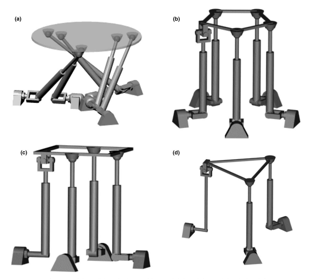
Fig. 4. Spatial parallel manipulators with (a) 6 dof (b) 5 dof (c) 4 dof and (d) 3 dof.

orientation and two independent parameters describing the platform position. Firstly, all joint variables of the U–P–U leg is solved. Now that it is possible to find the third dependent parameter describing the position of the platform, by making the direct position analysis of the U–P–U leg as a serial manipulator. Finally, we can find the joint variables of the remaining legs U–P–S legs since we found six parameters describing the position and the orientation of the platform completely.