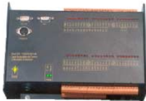
Figure 1: The Embedded Controller