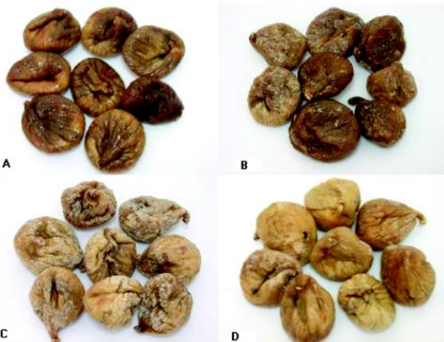
Figure 2—Photographs of intermediate moisture sun-dried figs after 3.5 mo of cold storage (rehydrated for 51 min in water at 30 °C (A); rehydrated for 16 min in water at 80 °C (B); rehydrated 1st for 4 min (C) or 8 min (D) in 2.5% H 2 O 2 at 80 °C and then for 12 or 8 min in water at 80 °C, respectively.)