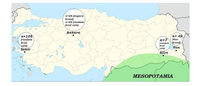
Fig. 1. The map shows the regions where samples were collected. The green shaded region shows the extension of ancient Mesopotamia, the northern part of the fertile crescent, into the South Eastern Anatolia region of Turkey.

For mitotype determination, 402 bp long mitochondrial control