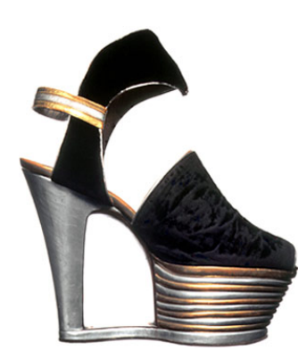
Figure 4.7. Platform Sole Shoe in covered cork

In Italy, women's feet, in contrast to China, were not their main physical attraction however. The Italian woman was known for an aesthetically pleasing face, breasts, and waist. No permanent damage was done to the bust in the West, but the waist, often tightly corsetted, could lead to miscarriage and infertility in women, and hair was often plucked or shaved from the forehead in imitation of classical sculpture.