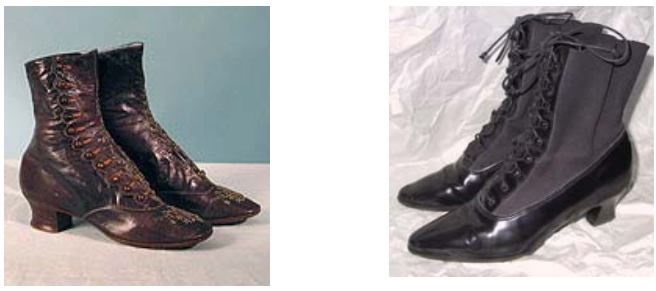
Figure 6.4. Leather Women Ankle Boots, 1850

By the middle of the nineteenth century mass production meant the cost of boots became affordable to more people. No longer the a reliable sign of status, the boot became a symbol of emerging equality not just between the sexes, but also among the social groups (O'Keeffe 1996).