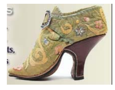
Figure 5. 1. French Red Heeled Shoe