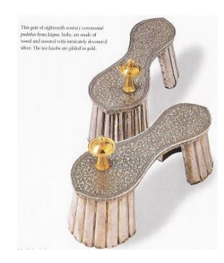
Figure 4.2. Indian Paduka

Shoes range from the simplest leather sandal or wooden paduka (toe-knob sandal) worn by a holy man, to ornate padukas of carved wood, ivory or even silver that have been widely adopted for ceremonial use. Heavily embroidered mojaris with their traditional curled toes and open or flattened backs are commonly worn in the north while juttis with their round or pointed toes are another variation.