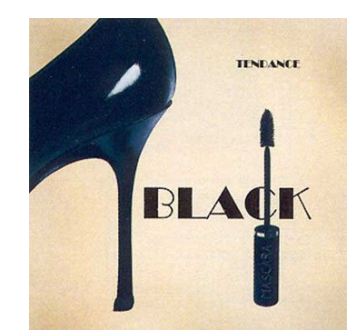
Figure 6.1. High Heels and Women

standards and self destructive desires to please men as the culprits responsible for causing women to don back breaking heels which limit mobility and cause extreme physical harm not only to the feet but also the knees and back.