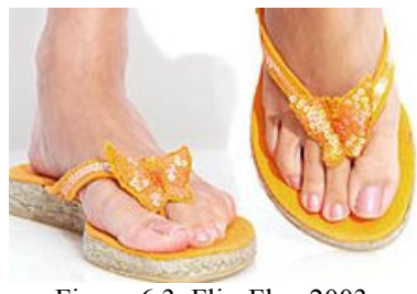
Figure 6.3. Flip-Flop 2003

Sport sandals have also emerged as an important style. They were invented in 1956 by brothers George and Ira Flop. In footwear and fashion, flip-flops are a kind of flat, backless sandal that consist of simple soles held on the foot by a V-shaped strap that passes between the toes and around either side of the foot, attached to the sole at three points. In American English, these are also known as thongs. In Hawaii, flip-flops are known as slippers. In many developing countries, especially in the tropics, rubber flip-flops are by far the cheapest manufactured footwear available.