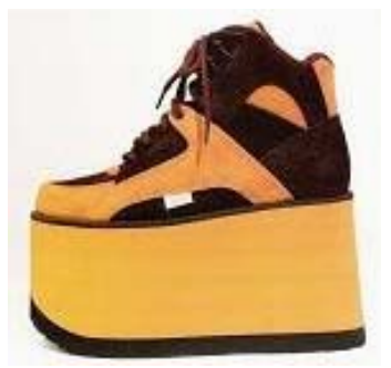
Figure 3.4. Platform Sport Shoes

The "nostalgia" and "retro" forms of recollection can be easily found among contemporary sport shoes. Sneakers are "the first new kind of footwear in the past three hundred years," says Richard Wharton, who is internationally famous as an expert on the cultural significanse of sport shoes. But already one of the hottest trends is revival of classic sneakers styles from the past. Indeed, trend reports cite the retro jogger right alongside other hot styles, like the platform sports sandals. Clearly, history can throw light on current fashion trends. (Steele 1998) For example, the nineties saw the return of platform shoes, via the Spice Girls, as well as the emergence of skate shoes - used more as casual fashion than sporting wear.