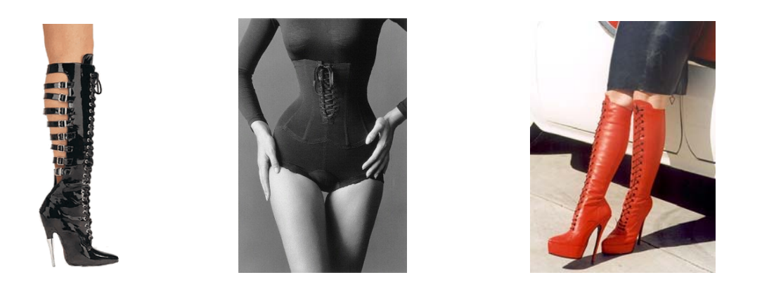
Figure 5.5. High Lacing Shoes and Tight Corsett

Tightly laced corsets are another fetishized items discussed. There are fantasies of being constrained and imprisoned in high heeled shoes and corsets. Corsets were part of women's wardrobes in the 19th century the way high heeled shoes are now. The idea that only the upper-class wore corsets is false, says Steele. She explains that while upper-class women could wear colorful satin corsets, respectable married women would only wear white corsets.