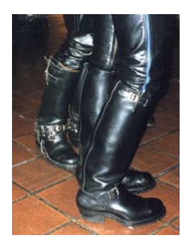
Figure 6.6. Biker Boots