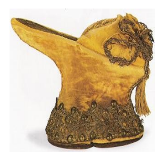
Figure 5.8. Venetian Chopine

There is no one defining moment when the chopines were invented. It made its major fashion appearance in the 15th Century and the popularity of this extreme shoe thanks to improved trade and transport spread throughout Italy, Spain, France and England in particular.