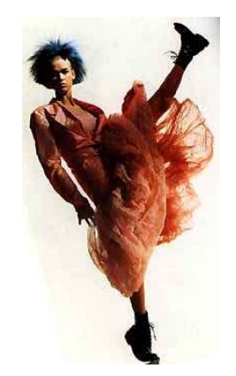
Figure 6.8. Doctor Marten Boots, 1990

In the seventies the US oil recession meant expensive fashion boots fell from fashion and. The youths from the suburbs were preferring an alternative life style which meant back to basic rock. The new rockers were punk and wore clothes more suited to bondage. This generation took to wear heavy-duty industrial style boots. The once ultra conservative, Dr Martens shoes became the trademark of urban youth excited by violence. Dr Klause Martens started to produce the air condition soles in 1947, but its popularity took until 1960 to peak. Its air-cushioned sole was the important thing for him. Doc Marten boots became the trademark of urban youth and were associated with the alternative Punk movement. They have brought the aggression.