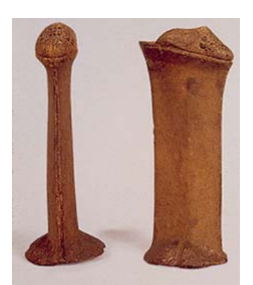
Figure 5.9. Twenty-inch Venetian Chopines 16th century

The origin is unclear, but it probably originated spontaneously in Venice and was first worn by prostitutes, but was then adopted by fashionable Venetian aristocratic ladies and the courtesans. The Venetians made the platform sole into a status symbol, revealing wealth and social standing for women. The chopine's height introduced an awkwardness and instability to a woman's walk. The Venetian woman who wore them was generally accompanied by an attendant on whom she would balance. Despite the obvious expense, Venetian sumptuary laws (laws regulating expenditure on luxuries) did not address the issue of exaggerated footwear until it reached dangerous proportions. Sixteenth-century accounts suggest that the chopine's height was associated with the level of nobility and grandeur of the Venetian woman who wore them rather than with any imputation as to her profession.