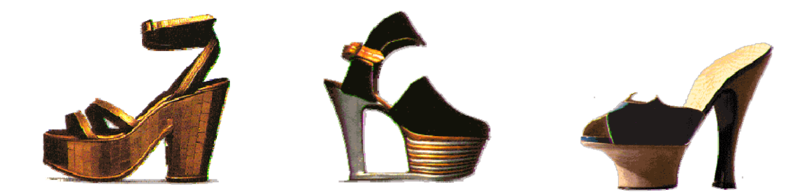
Figure 5.10. Platform Sandals of Andre Perugia, 1939, Salvatore Ferragamo, 1935, Andre Perugia, 1939

So the 30s had passed and toward the end of the 1960s, platforms re-emerged. At the beginning of the fad, they were worn primarily by young women in their teens and twenties, and occasionally by younger girls, older women, and (particularly during the disco era) by young men, and although they did provide added height without nearly the discomfort of spike heels, they seem to have been worn primarily for the sake of attracting attention.