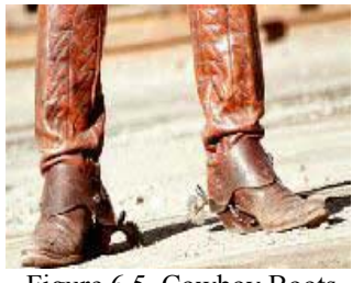
Figure 6.5. Cowboy Boots

The origins of the Cowboy Boot are well researched and started life as riding boots for the marauding Mongol tribesmen. Horsemen wore red wooden heels and conquered all before them. In the past, the only people who wore cowboy boots were cowboys. Over the past quarter of a century, however, cowboy boots have become incorporated into the fashion vocabulary, for both women and men. As a special subcategory of riding boots, cowboy boots obviously evoke the horsemen of the Wild West, so the symbolism of the boots is directly related to the symbolism of the cowboy. (Steele 1998, p. 141)