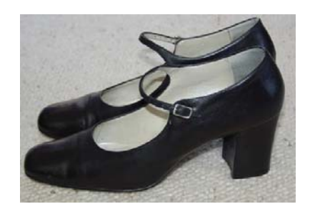
Figure 3.2. Mary Jane 1920

There are many definitions, especially since the shoes seem to reinvent themselves each fashion season by different designers. Mary Janes continue to reinvent themselves with each passing fashion season, never seeming to be out of fashion, because they are able to adapt to the latest trend promoted by designers. Thus, this shoe has been around centuries to evolve into the shoe it is today.