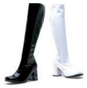
Figure 6.7. Go Go Boots, 1960

In the seventies the US oil recession meant expensive fashion boots fell from fashion and. The youths from the suburbs were preferring an alternative life style which meant back to basic rock. The new rockers were punk and wore clothes more suited to bondage. This generation took to wear heavy-duty industrial style boots. The once ultra conservative, Dr Martens shoes became the trademark of urban youth excited by violence. Dr Klause Martens started to produce the air condition soles in 1947, but its popularity took until 1960 to peak. Its air-cushioned sole was the important thing for him. Doc Marten boots became the trademark of urban youth and were associated with the alternative Punk movement. They have brought the aggression.