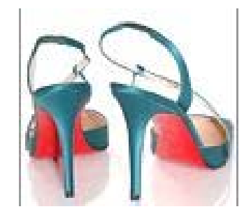
Figure 5.2. Louboutin Red Sole Shoe

That red heeled shoes have always been considered special. Like most of the royal heads of Europe, Louis XIV adopted red as the colour of kingship: his wooden heels were covered in red leather and this distinctive fashion quickly spread to his courtiers. Red heels were one of the few seventeenth century fashions to appear in England before being seen in France. It was at this time that the fantastic form of decoration known as the shoe rose became a craze in aristocratic circles. In modern fashion red is the most daring an outrageous shoe colour and designers consider the wearer to be blatantly sexy. Today, Louboutin is one of the famous contemporary shoe designers who made shoes with the red soles. He paints the soles of all his shoes bright red, regardless of their colour. And says, "I wanted to break the dullness of black or beige soles. And present a 'finished' object. All my soles are red." A trademark which he hopes will, as usual, be imitated.