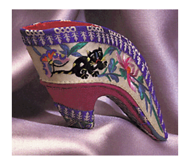
Figure 4.4. Lotus Shoe

Chinese girl's feet were wrapped very tightly with cloth so that they could not grow anymore. It was a common practice in China between 950-1912 A.D., until it was outlawed. These girls with "lotus feet" grew up to be women with tiny 3 to 5 inch feet in length. The custom of binding the foot into the shape of a pointed lotus bud was carried out by millions of Han Chinese women of all social classes. Bound feet were required for a Han woman to be considered marriageable. They were a mark of status, beauty and sexual attractiveness.