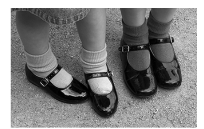
Figure 3.1. Mary Jane 1900

in some measure is still desired by women, because it is reminiscent of a simpler time for the wearer. Mary Janes have proven their popularity and staying power through the years and even centuries.