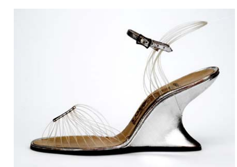
Figure 4.8. Invisible Shoe

When steel was commandeered for the extension of the Abyssinian War in 1936 he devised cork wedges heels. The style was ignored at first but he persevered until it became the most popular throughout the war years.