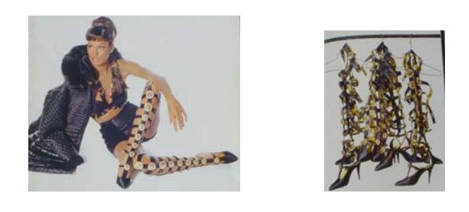
Figure 5.6. Versace's 1992 "Bondage" Collection

Fashion designers such as Gianni Versace and Jean-Paul Gaultier have brought fetishism and S&M imagery to haute couture. This picture shows a Versace advertisement from Versace's 1992 "bondage" collection, the woman outfitted in S&M style with black leather and boots. This collection was the focus of a New York Times article, "Chic or cruel?" debating whether the style exhibits misogynistic sexual fantasy or liberation.