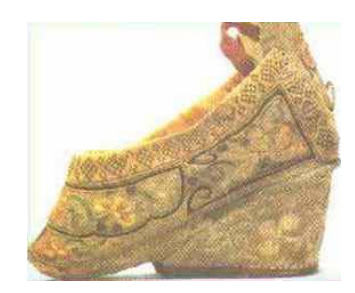
Figure 4.5. Lotus Shoe

This Chinese custom was not a matter of male domination at all, also has all of the signs of a woman behind it. The process of foot binding is so horrifying and unwrapped bound feet are so grotesque that it would have frightened the any man.