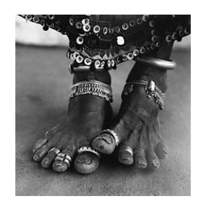
Figure 4.1. Holy Feet in India

The foot is the one of the most admired parts of the female body in the Indian perception of romanticism and eroticism. This may be one of the reasons why young girls and women decorate the soles of their feet in very special ways, for example by colouring them with red alta or kumkum paste, by using these to paint intricate designs on them, or by tatooing them.