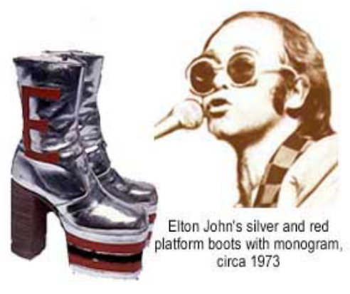
Figure 5.11. Elton John's Platform Boots 1973

Platforms do not look right on professional women and especially, on older women. Moreover, high platforms are like walking on stilts and look more awkward than sexy.