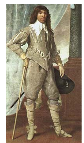
Figure 6.2. Men with High Heeled Boots, 18.yy

power, adopting them for their own instead of reclaiming the "feminine" in a powerful and authoritative way- but they do with high heels.