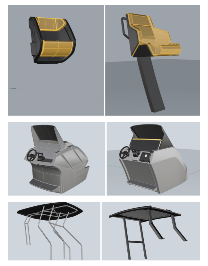
Figure 4. CAD modelling of Northstar Orion 9

Subsequently, the design was further developed, and drawings were created for all the components to be manufactured. The components, such as the steering wheel, electronic devices, stainless-steel components, upholstery boxes, and storage compartments were ordered from manufacturers such that the final prototype would appear realistic. After discussing with the stakeholders, most of the designs were realised using moulded fiberglass and laser-cut bent stainless-steel sheets. All detailed design drawings were supplied in a digital format to RIBTECH and are omitted herein.