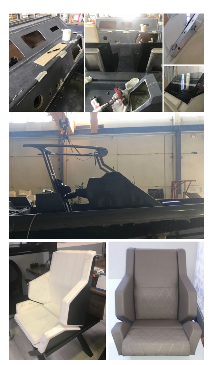
Figure 6. Northstar Orion 9 Console, console glass, seat, hardtop prototype, and final product

The new console with a wide front window provided better visibility. The darker colour implemented on the boat