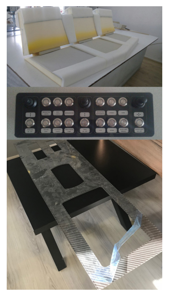
Figure 7. Northstar Orion 9 with redesigned back seats, electronic control switches, and console carbon-fibre film laminated plexiglass

Additionally, the production process for the seats was simplified, i.e. curved, laser-cut stainless steel was used instead of a double-sided mould. The upholstery of the seats was replaced with a more sophisticated textured and patterned fabric, which provided an elegant appearance. Handles were installed on the mounting portion of the seat unit to provide safety when walking or when standing while driving.