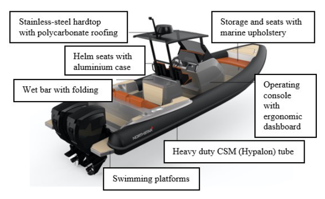
Figure 1. Main components of the RIB

In this study, the following questions were addressed based on the results of practice-led research: