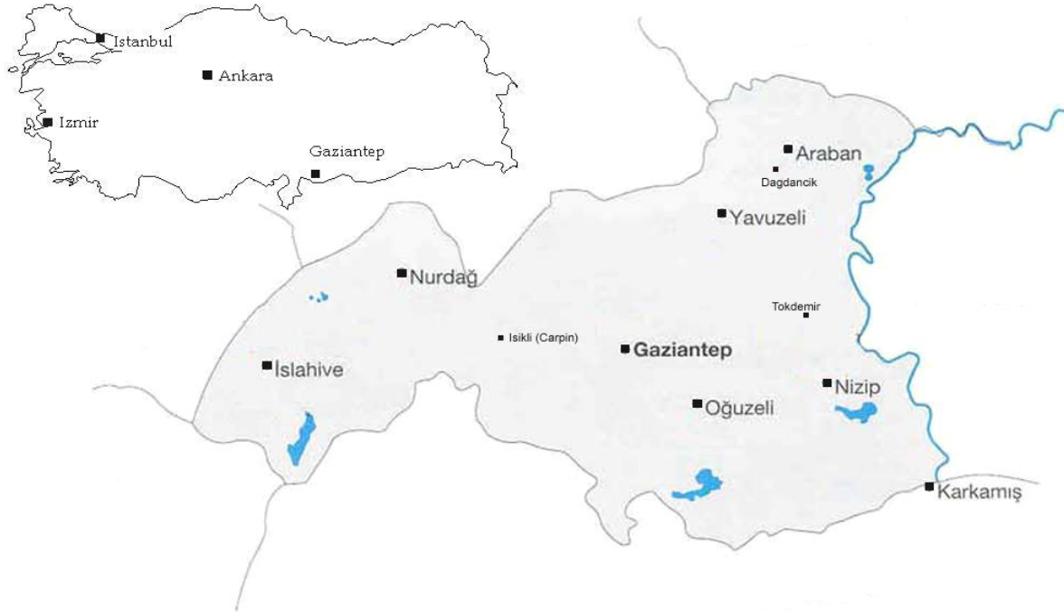
Figure 1. Map of Gaziantep Işıklı (Çarpın), Dağdancık and Tokdemir.

identified at Aegean University Botanic Garden-Herbarium Research and Application Center in İzmir. During the identification of plants, the Flora of Turkey and East Aegean Island (Davis 1965-2008) and other related books were used. After identification, plants were categorized based on their family name.